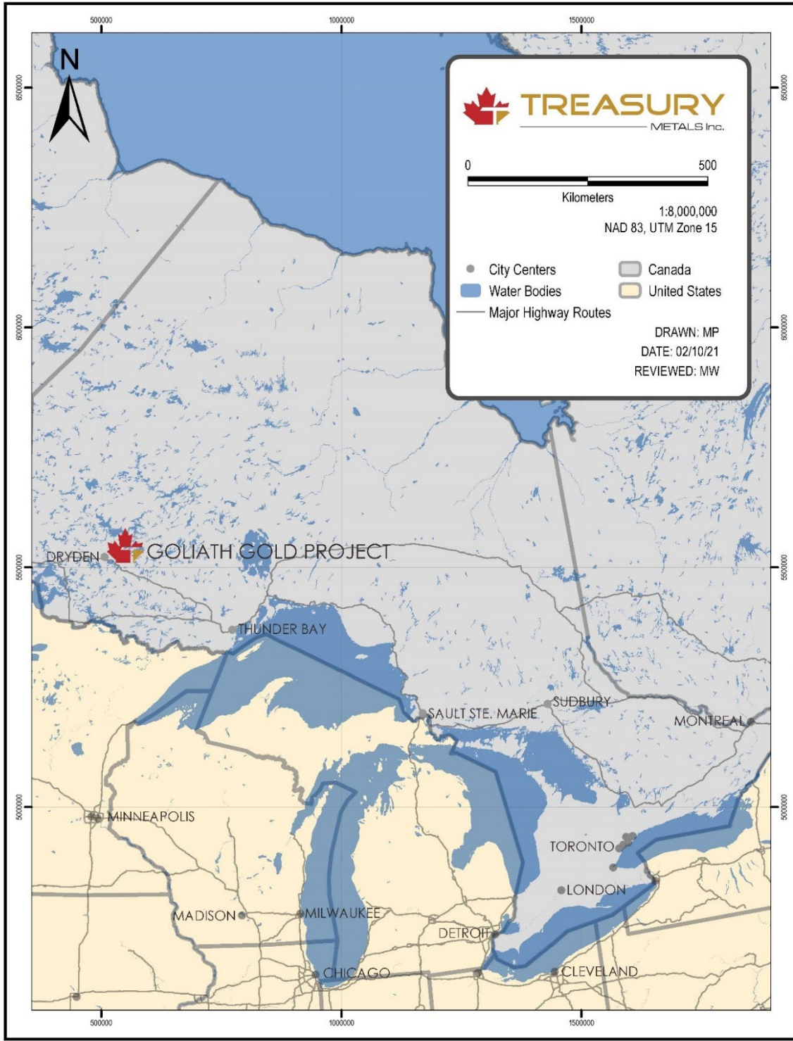
Figure 1: Project Regional Location